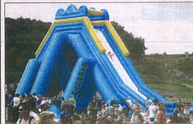
Giant picnic and family fun day.